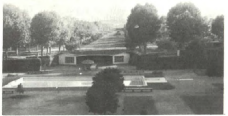
De Anza College, 1959. A quiet orchard, Le Petit Trianon, guest cottages, a swimming pool. Library is now located just in back of the swimming pool, which has been converted into a fountain.