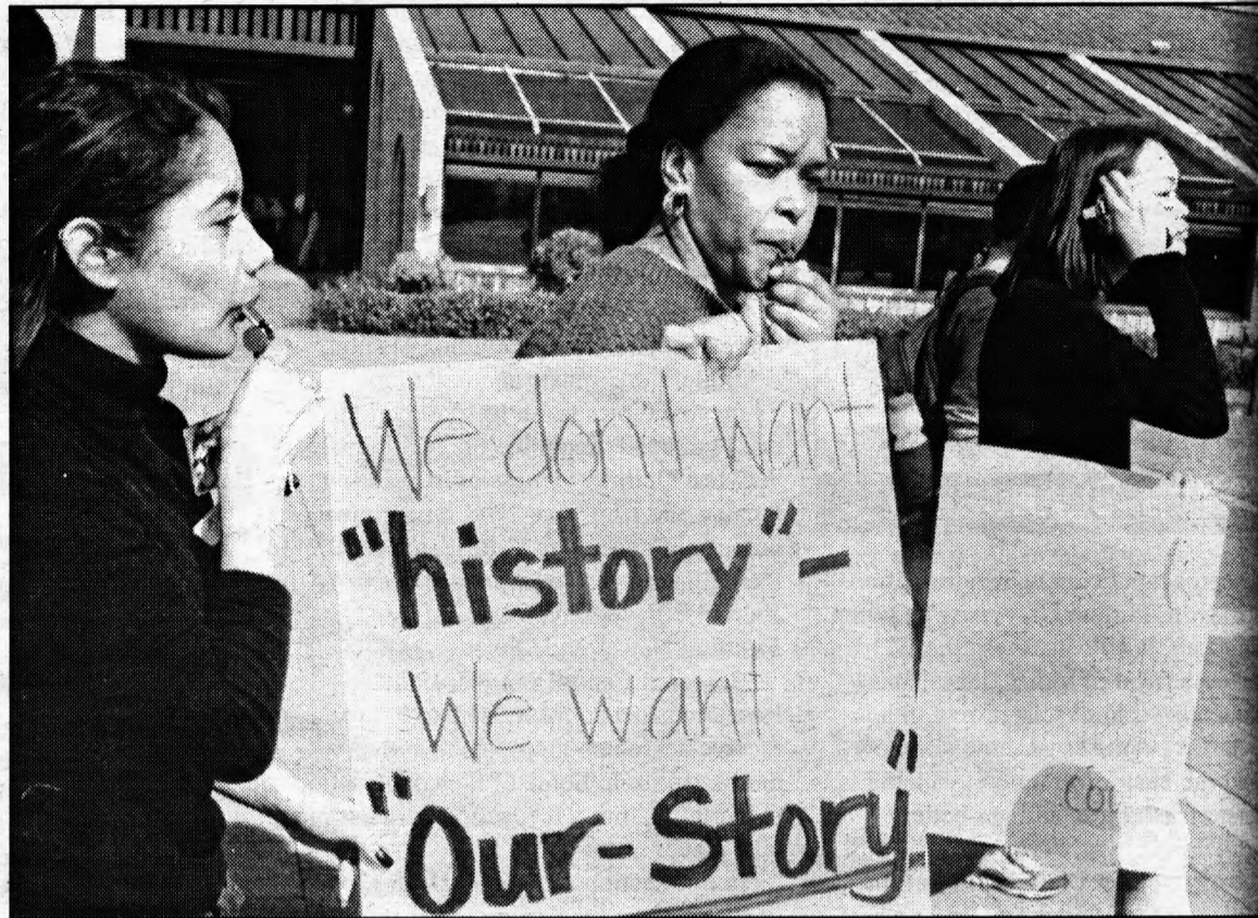
Members of Students for Justice drum up support for a student walk out held on Feb. 22.